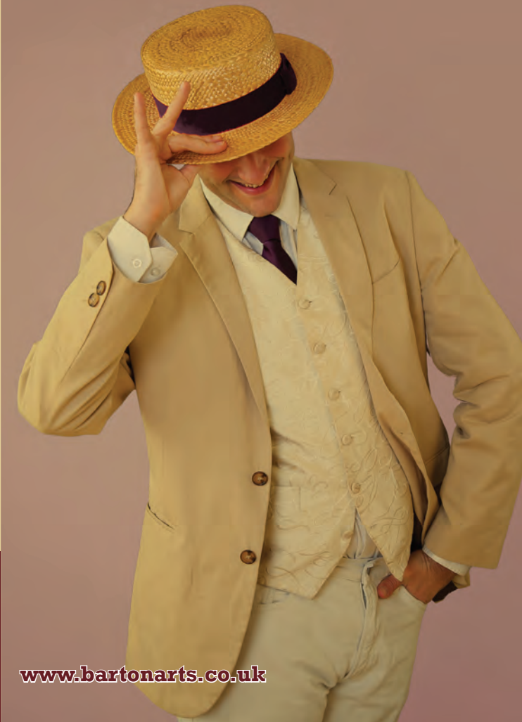
Cover image: Pantaloons

Everybody loves Ernest. In fact, Cecily and Gwendolen are both engaged to Ernest. The only trouble is, Ernest doesn't exist. Or does he...? As well as Wilde's witty words, The Pantaloons' energetic and musical new production takes influence from silent film, Victorian music hall and contemporary physical theatre to add a few twists to this perennially popular play!