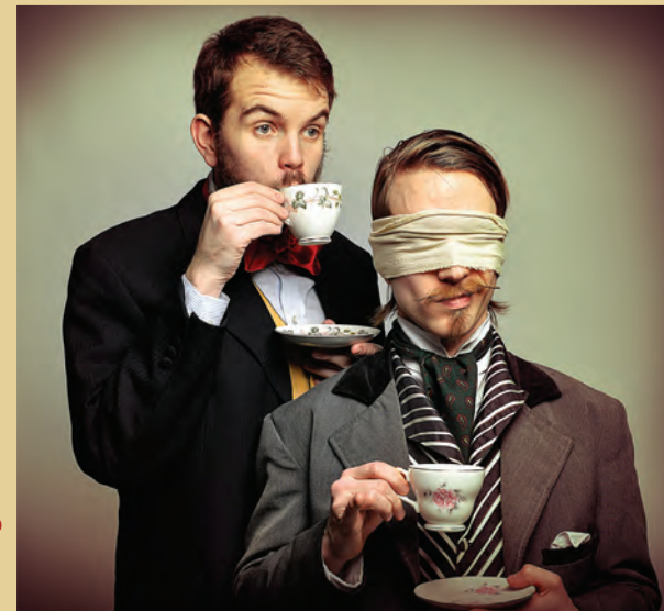
Morgan & West

No future is left unseen and no timeline left unaltered as these temporal tricksters burst into the twenty-first century with a show brimming over with baffling magic, unparalleled precognitive powers, and a totally genuine ability to travel through time! An unforgettable evening of magic, mystery, and the unexplainable.